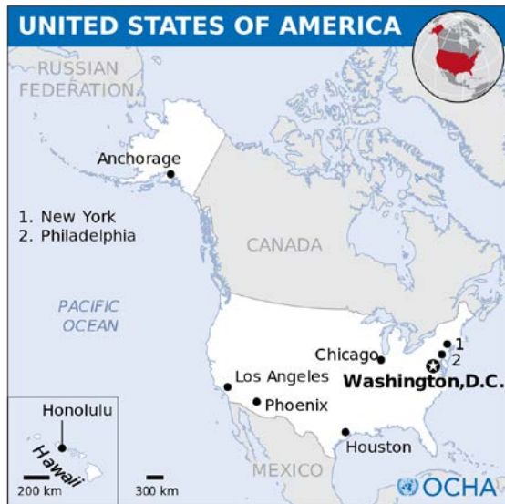
Figure 1: Orange County is located close to Los Angeles, California, USA.

Around 1965, the Orange County Sanitation District (OCSD) began operating its first secondary treatment process unit - a trickling filter - to treat municipal wastewater. Initial studies assessing the post-injection water quality, using a pilot injection well and secondary effluent, quickly revealed that additional (tertiary) treatment would be necessary to avoid septic conditions in the aquifer, plus the dispersion and mixing in the subsurface alone was insufficient to dilute the mineral content of the reclaimed water.