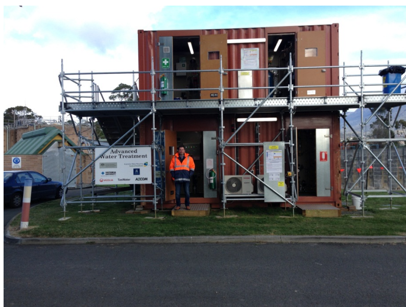
Figure 2: AWTP on site at SPWWTP.

The AWTP constructed by AAD was contained in two shipping containers, with the control system, compressor and storage housed in a 3 rd shipping container. The AWTP was installed at the SPWWTP during May 2014 and operated until the end of May 2015. SPWWTP is a biological nutrient removal plant that operates both trickling filters and suspended growth treatment steps. Feed was sourced from the Selfs Point effluent channel prior to UV disinfection. A 2 mm screen was placed on the demonstration plant feed line to remove any large particles and flocs within the SPWWTP effluent. While water quality from SPWWTP was often stable with turbidity values \leq 2 NTU, ammonia \leq 1 mg/L and dissolved organic carbon (DOC) 8 mg/L, there were extended periods of time when maintenance activities on SPWWTP led to higher turbidity (3-5+ NTU) and ammonia (1-10 mg/L) but DOC remained unchanged. The AWTP on-site at SPWWTP is shown in Figure 2.