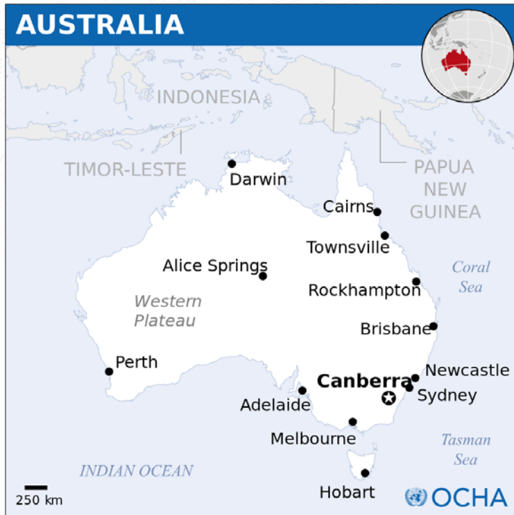
Figure 2: Location of the Beenypup Groundwater Replenishment Trial, Perth, Western Australia.

The findings of the trial concluded that replenishment of groundwater sources using recycled wastewater was a viable option to augment drinking water supplies for the region. During the trial, it was estimated that it would take ~50 years before recycled water was drawn out and used for potable purposes. Water drawn from the aquifer will be used to service the population of 2million in the region. The scheme has won 4 state and national awards to date.