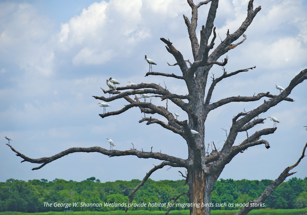
The George W. Shannon Wetlands provide habitat for migrating birds such as wood storks.