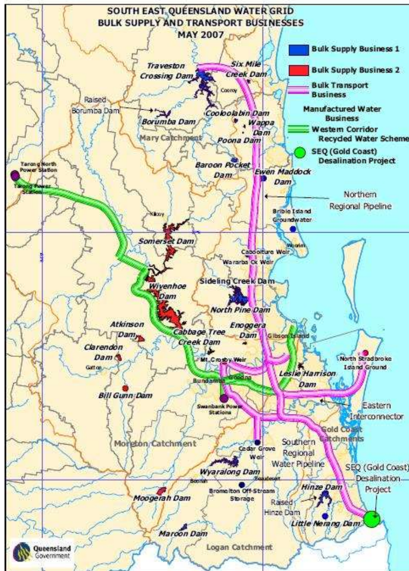
Figure 2 Schematic diagram of the South East Queensland (SEQ) Water Grid, which will include the WCRW project. (Urban Water Supply Arrangement in South East Queensland 2 )

It is therefore essential that each stakeholder operating within each treatment barrier obtains the appropriate water quality information in real-time, to ensure the integrity of each barrier can be maintained according to a Hazard Analysis Critical Control Point (HACCP) based management approach 3 . To achieve this, the Queensland Recycled Water Guidelines (QRWG) recommend online or continuous analysers be employed for operational monitoring, in preference to discrete or grab samples for Critical Control Points (CCPs), Quality Control Points (QCP) and Critical Measures (CM) that have been identified through HACCP 3 . This is to ensure that the recycled water produced within each barrier is of a quality specified for its intended use, and to shift to a more preventative management approach for the PRW system. If the monitoring is not continuous and non-conformance is detected, the corrective action will have to be applied to all non-conforming recycled water since the last sample was taken 3 . Therefore, a consistent supply of PRW can only be achieved effectively when continuous, real-time, accurate water quality information is employed for operational monitoring purposes.